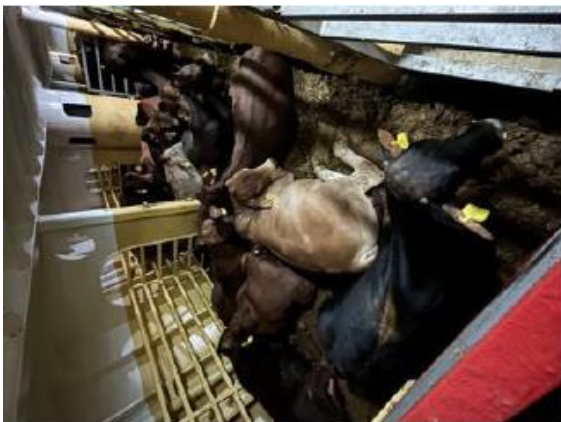
Day 14 Cattle in pen — no issues identified