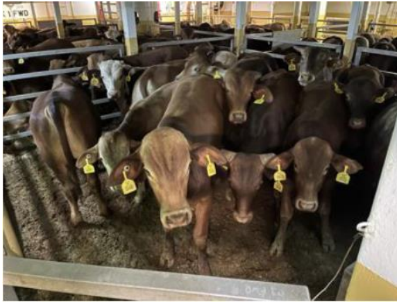
Day 2 Cattle in pen — no issues identified