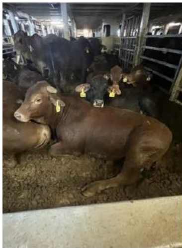
Day 12 Cattle in pen — no issues identified