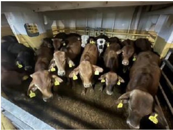
Day 6 Cattle in pen — no issues identified