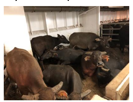
Day 3 Buffalo in pen—no issues identified