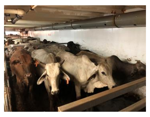
Day 8 Cattle in pen—no issues identified