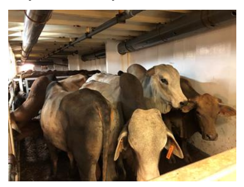
Day 3 Cattle in pen—no issues identified