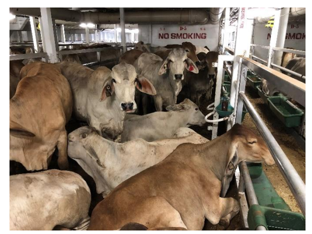
Day 4 Bos Indicus—no issues identified