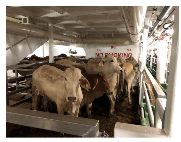
Day 2 Bos Indicus—no issues identified