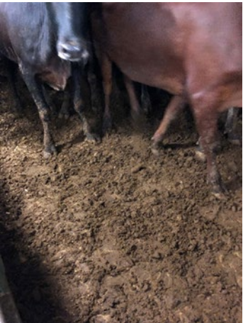
Day 3 Cattle in pen – no issues identified