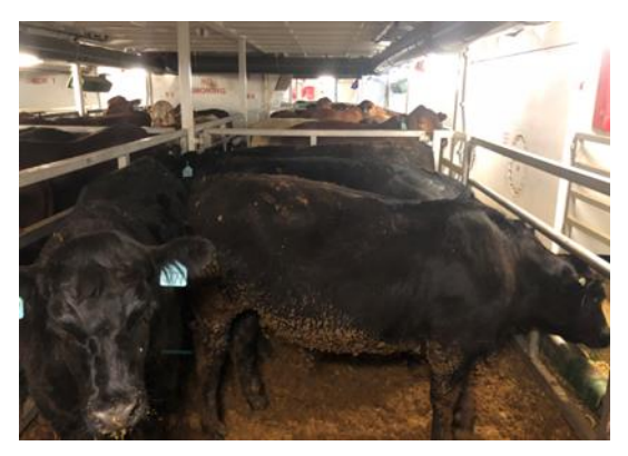
Day 13 Cattle in pen—no issues identified