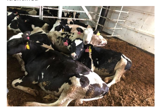
Day 15 – Cattle in pens during discharge. No issues identified