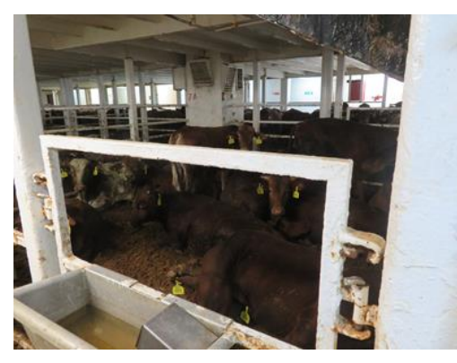
Day 8 Cattle in pen—some coat contamination