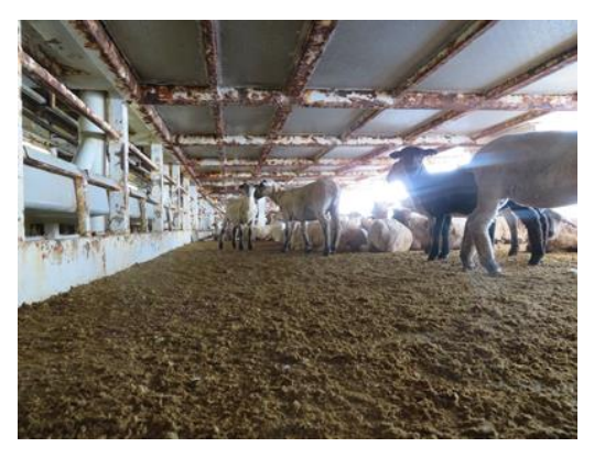
Day 11 Sheep in pen—no issues identified