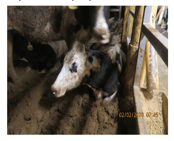
Day 10 Cattle in pen prior to wash down