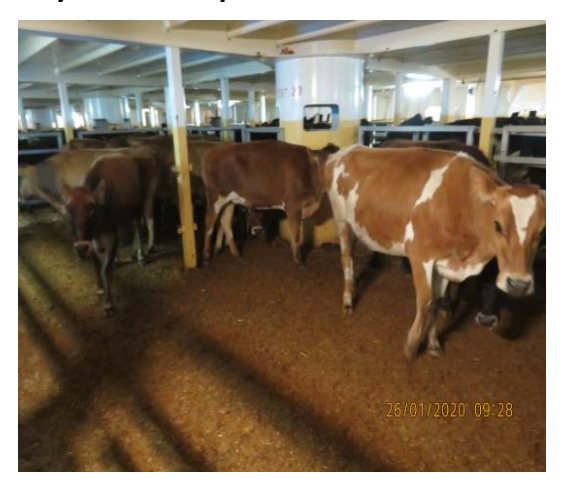
Day 3 Cattle in pen – no issues identified