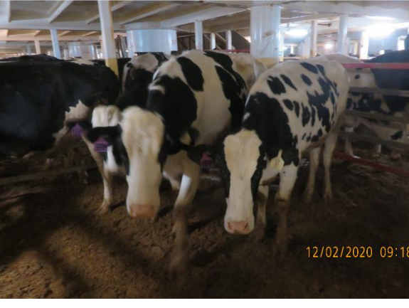
Day 20 Cattle in pen – no issues identified