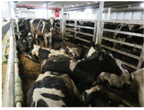
Day 15 Cattle in pen – no issues identified