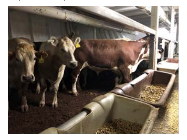
Day 13 Cattle in pen — no issues identified

Day 2 Cattle in pen — no issues identified