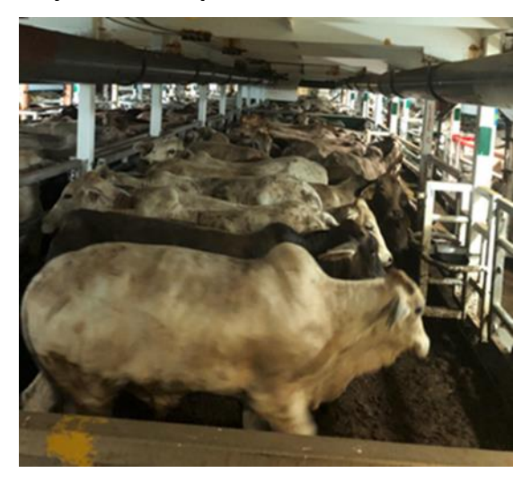
Day 2 Cattle in pen—no issues identified