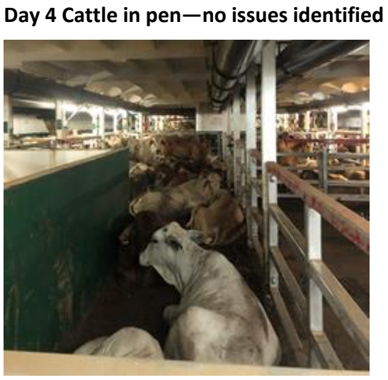
Day 5 Cattle in pen—no issues identified