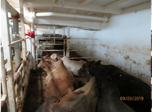
Day 12 Cattle in pen - no issues identified